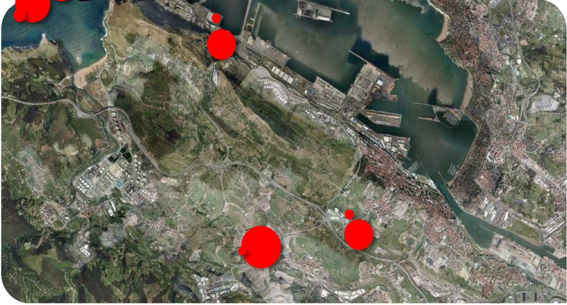
El Sip es un Espacio para crear empleo mediante entidades que satisfacen necesidades sociales de forma innovadora